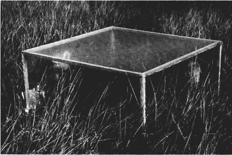
Fig. 1. ^{14}\text{C} labelling experiment on a herb-rich sedge fen with Carex rostrata and Potentilla palustris (Suurisuo mire complex, Janakkala, southern Finland, June 1992).

Preliminary results for Carex rostrata show that below-ground parts form the bulk of living biomass of the species (Fig. 2). Up to 90% of the phytomass of sedges may be located below ground. The majority of below-ground parts are located within the uppermost 25 cm. However, there were living roots even below 50 cm, which, according to Metsävainio (1931), is maximum